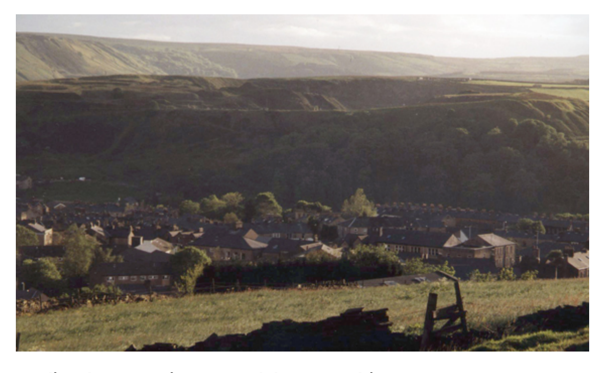
Haslingden Town in Rossendale, Lancashire

We offer an extensive range of raw materials and components for footwear and leather goods manufacturing and orthopaedic creations. We are proud to distribute over 40 trademark brands that are supplied globally here in the UK, and are passionate that the products we supply meet our customers standards and requirements. We achieve this through our commitment to innovation, quality, customer service and collaborative partnerships.